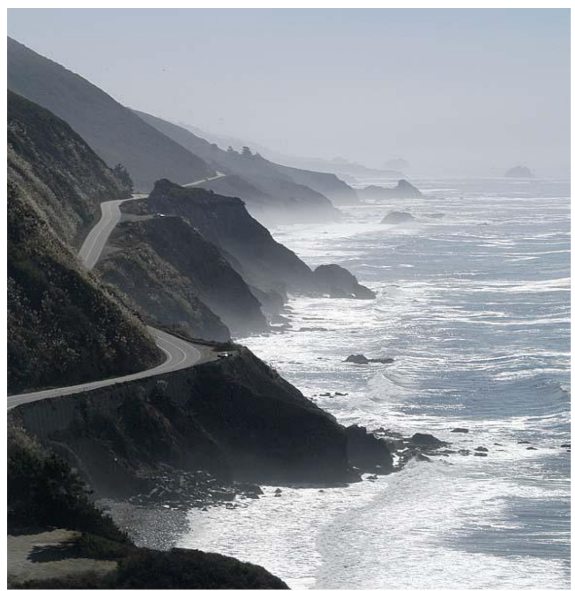
California Highway 1 before the gathering storm. Can you see riders in this picture? Any bike-pieces pounded by the surf?

The fate is unknown of 3 valiant women SBBMW Riders near Big Sur as a 2<sup>nd</sup> rainstorm in two days gathers there. An ominous sign has been the abrupt loss of cell-phone communications between the editor of this newsletter and one of the riders functioning as a free-lance reporter in the field. The 3 women riders set out on Friday for the SBBMW Riders' usual, early November Big Sur