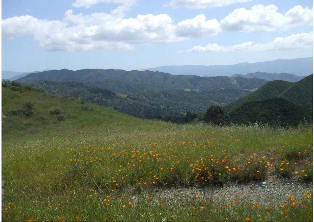
April Flowers That Brought the Summer That Hardly Was – On the Figueroa Mountain Road, Santa Barbara County