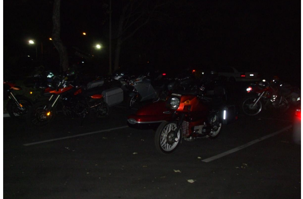
Club-members' BMWs parked at night; club-members inside Sizzler's not shown due to eating manners.

Pages 2 & 3: from the September 2011 Range of Light Gypsy Tour that traversed the Sierras and camped in '49er mining towns such as Angels Camp and Placerville.