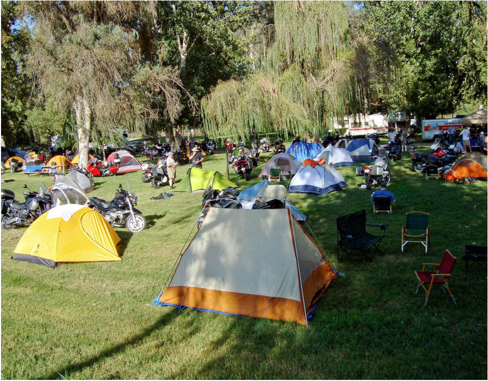
Riders Camped at Lindy's Landing in Reedley,CA