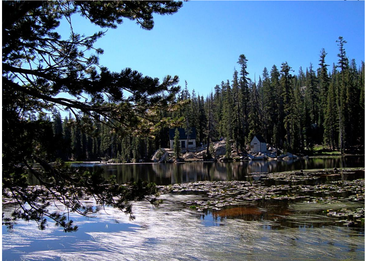
Small Roadside Lake on Highway 4