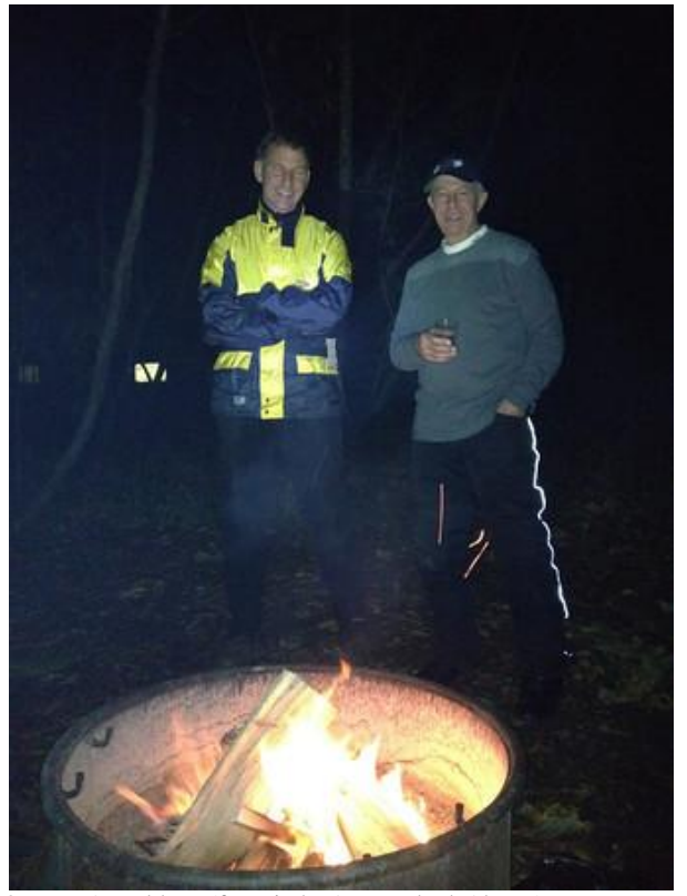
2 guys, 1 cauldron (for witches' or warlocks' brew)