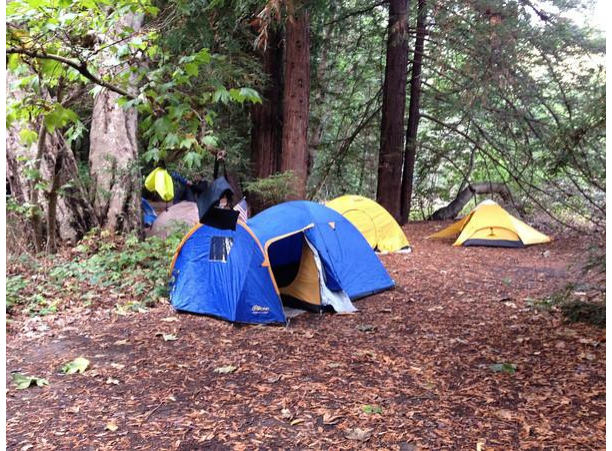
Would that there were a good cheap motel near Big Sur....