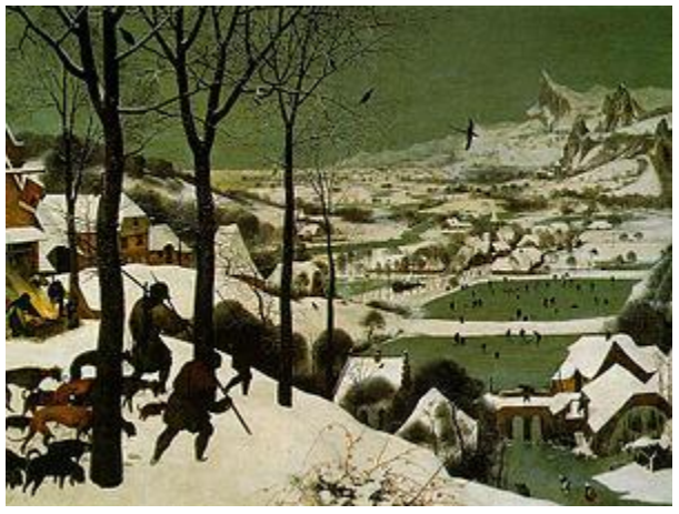
Jagers in de Sneeuw (1565)

*Agnostics, Deists, Buddhists, et al. welcome. Particularly lovers of pagan-origin winter festivities in the Deutsch or Dutch Forest. As long as there's a Tannenbaum und Schnapp, Advocat, oder Jaegermeister..