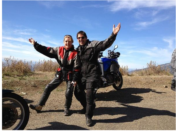
All's well that ends well, I guess