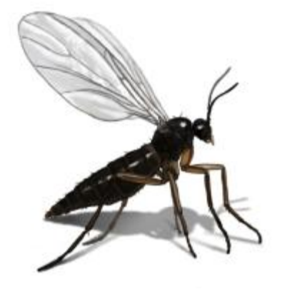
Morro Bat gnat after eating dinner of raw girlfriend