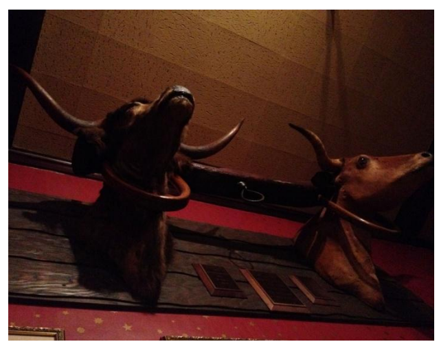
Horned animals in Far Western Café watching the 3 diners