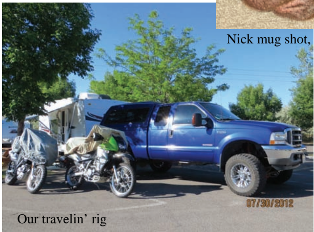
Our travelin' rig