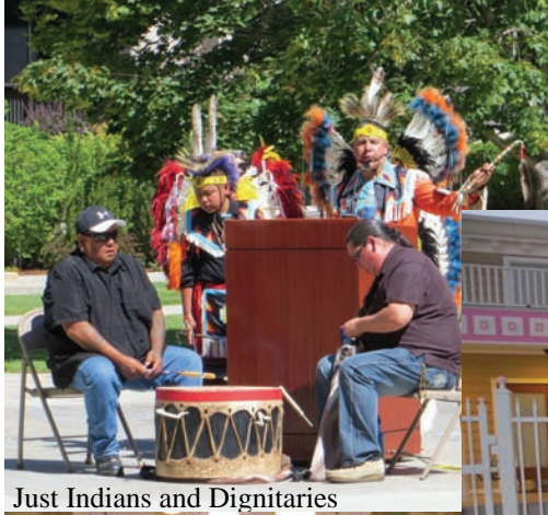
Just Indians and Dignitaries

(For more info on the women's conference: http://www.americanmotorcyclist.com/events/womenandmotorcycling/IWMCNews/12-08-07/Riders_celebrate_at_AMA_International_Women_Motorcycling_Conference.aspx )