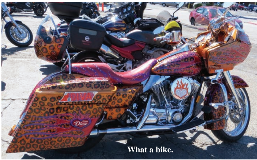
What a bike.