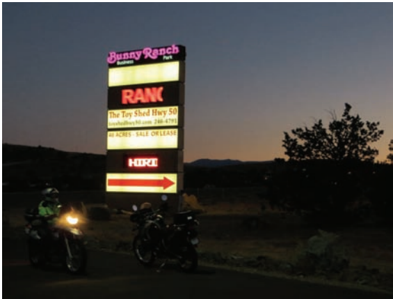
Yes, it's in a Business Park! Just business that's all honey....