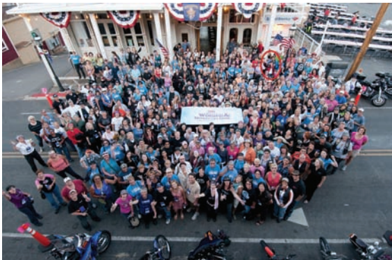
Where is Waldo, downtown Virginia City after dinner group shot.