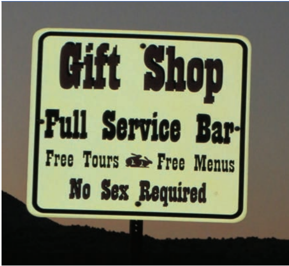
Gift shop sign letting you know you can come on in for the bar...