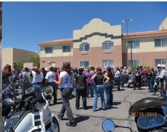
Riders meeting at the Casino