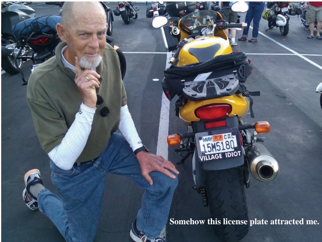
Somehow this license plate attracted me.