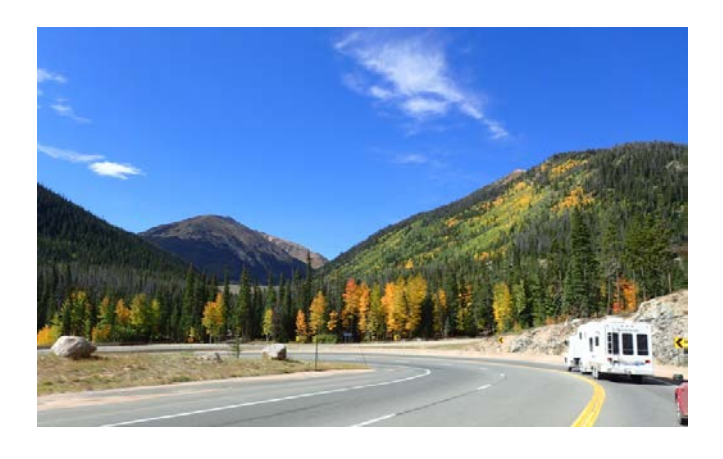
Fall colors on Berthoud Pass, CO. east of Denver.