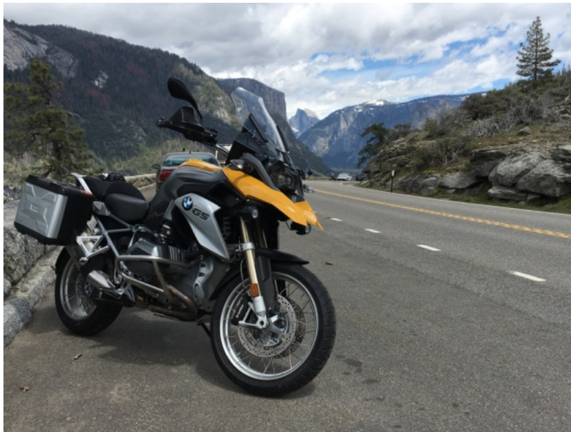
Yosemite, Highway 41.