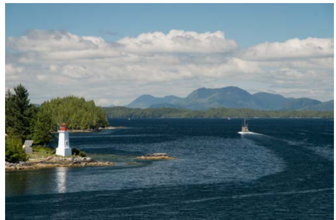
View from the Port Hardy-Prince Rupert ferry.