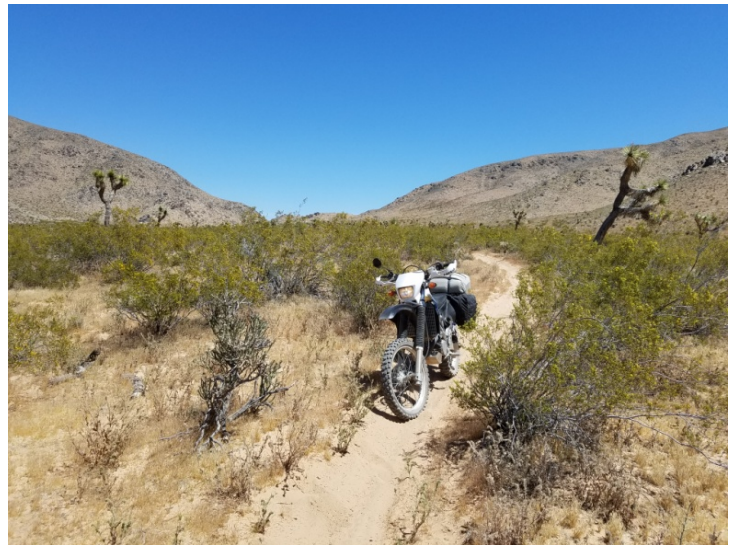
More photos on Page 6.

I am still glad I went because that part of the country is truly beautiful and I would have not gone there by myself.