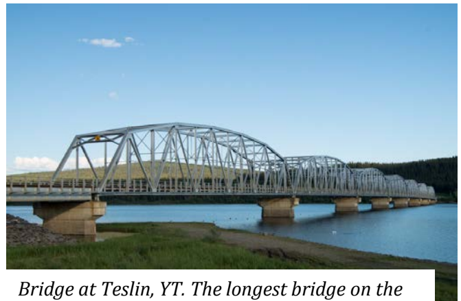
Bridge at Teslin, YT. The longest bridge on the Alaska Highway.