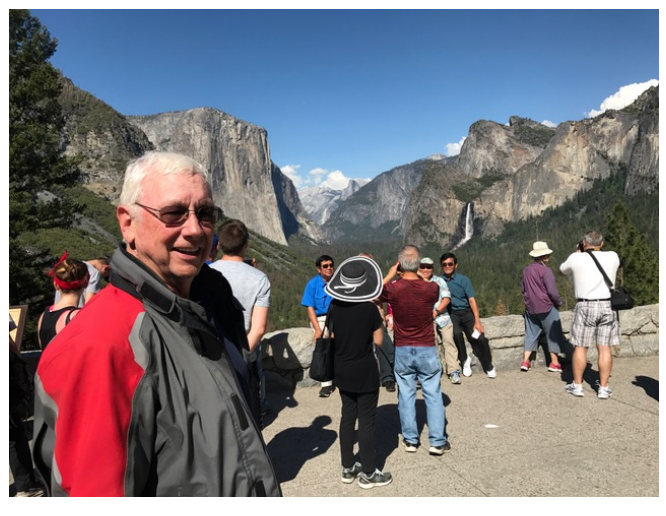
Chuck's Travels Through the Sierras, June, 2017