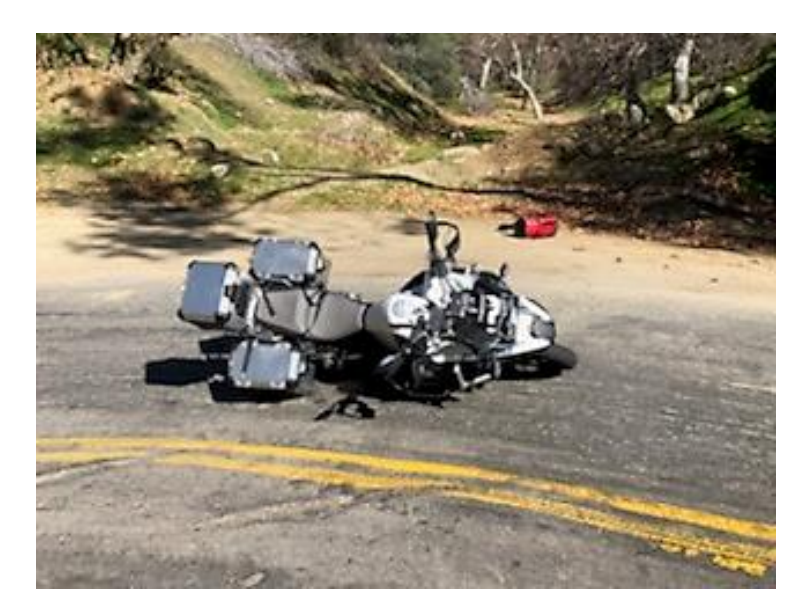
Oh no! The pristine R1200 GSA gets dropped on Caliente-Bodfish Road.