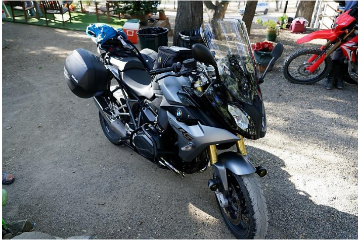
Deb's new-to-her R1200RS, 4 years old, 6000 miles.