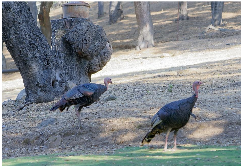
Surprise guests at the picnic.