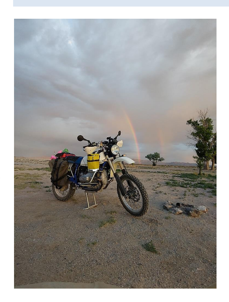
At Basin and Range National Monument, NV.