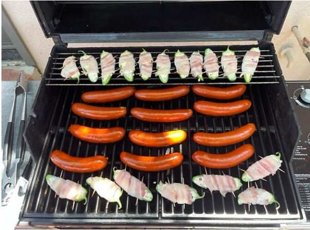
Delicious grilled meats and jalapeno poppers.