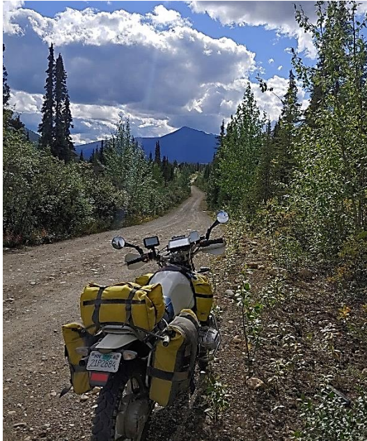
Left: Riding on South Canol Road.