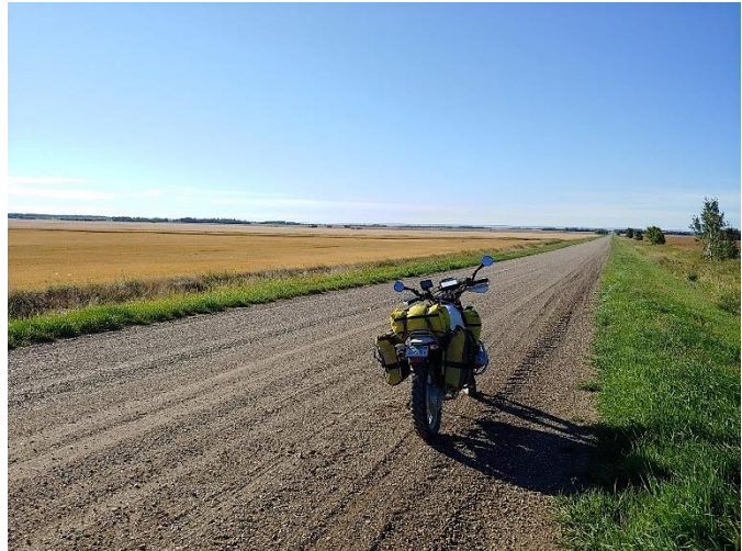
Below: Some of the roads were long, flat and boring!

The rally ended in Jasper. The best car was off by only 17 seconds! Marten was in 1 st place for motorcycles; the previous time, he was in 4 th place. Except for one section of road getting cancelled due to fires, the weather was otherwise good, with clear skies and some light rain. After the rally, Marten visited family in Canada and then continued back to Santa Barbara. His mileage total for the trip (getting there and back, and the rally mileage) was 8,000 miles.