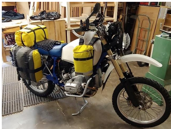
Above: Marten's R100 ready for the Alcan 5000.

During our September meeting, Marten described his adventures in this year's Alcan 5000. This is a 10-day, 5,040-mile event which is a time-speed-distance (TSD) endurance rally. This isn't a race where the fastest team wins, but a precision event where competitors travel on public roads or trails, following specific routes at precisely the right rally-designated speeds. Teams with the closest time to their "perfect on-time" wins their respective class. There are both winter and summer events, but only the summer event is open to adventure motorcycles. For the 2022 summer event, there were 28 autos and 17 motorcycles.