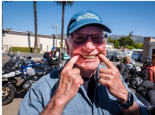
Below: The scene at Tech Day.