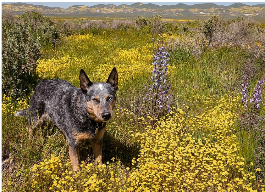
Above and left: Carrizo Plain is abloom!