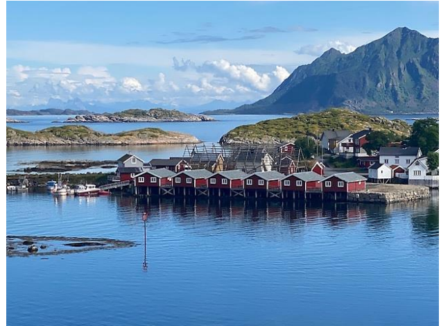
Above: Svolvær, Lofoten Islands.

the road so someone would know where to look. I couldn't tell if I was riding in a canyon or on a ridge. After several km the fog dissipated and eventually the wind died down.