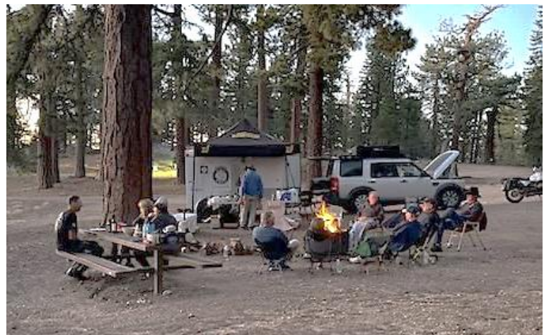
Campout at Campo Alto.