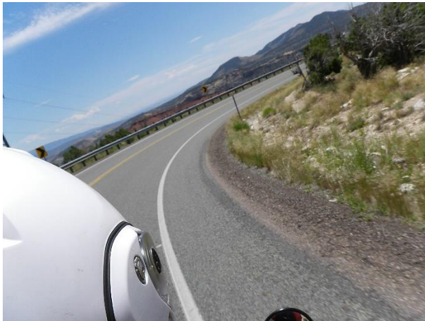
The best views are from a motorcycle helmet.

Article here: Texas outlaws lane splitting