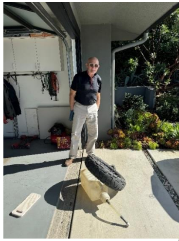
↑ 2. Warm it in the sun - both sides.