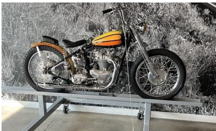
Above: A custom Triumph, one of the motorcycles on display at the Petersen Museum.