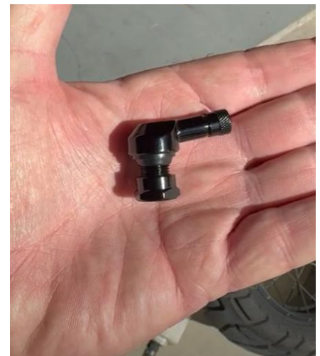
↑ 3. Check out the new right angle valve stems - looking good and I was looking forward to less hassle when airing up the tires.