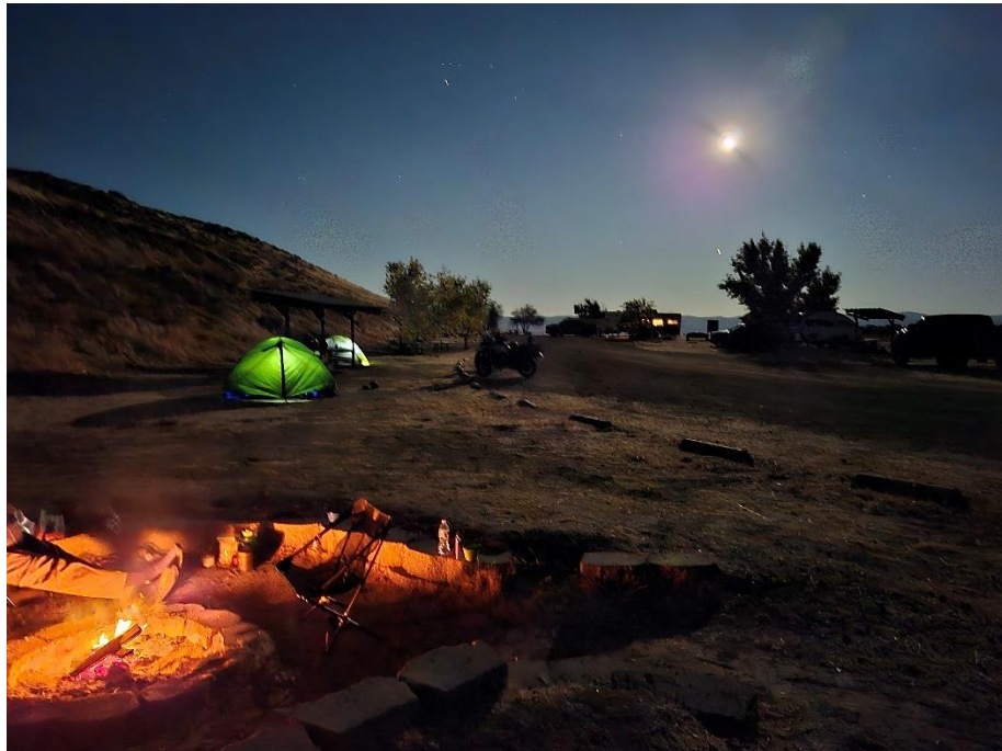
Below: Nighttime at Selby Campground.