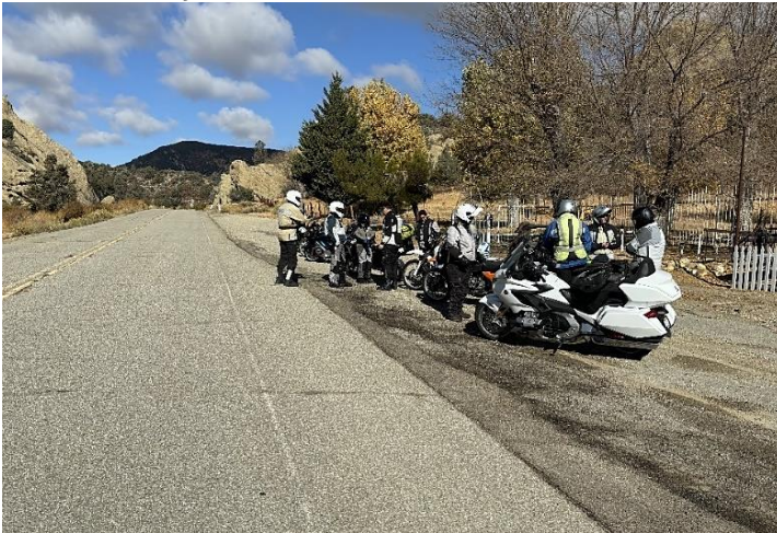
Above: 10 bikes and 11 people just before Highway 33's peak. Sunny but quite chilly.

On Sunday, they rode to Wallace Creek, then on to Elkhorn Road and then Hurricane Road to Taft. The silt on Hurricane Road was extremely challenging. Steve and Fran, riding two-up, had a very exciting ride up a steep, silty hill. (Remember, adventure is discomfort recounted at leisure!)