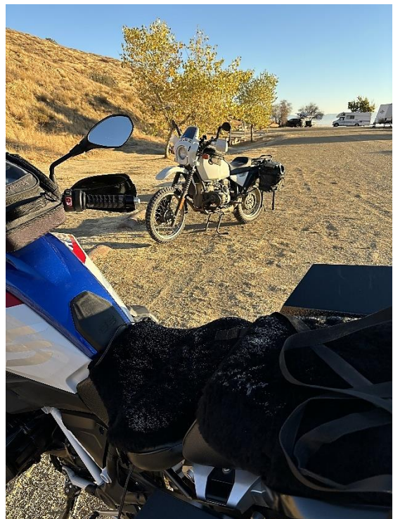
Right: The bikes had a light coating of frost still on at Selby Campground and this was the warmest campground option!