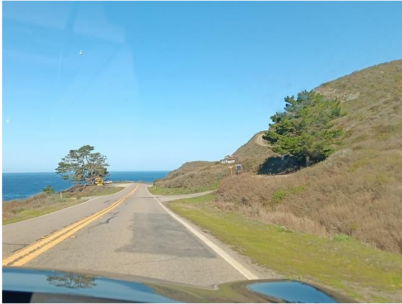
Left: No RV's on this section of Highway 1! Right: The very exciting staircase to the ocean at Ragged Point. We stopped short of the falling-apart steps.

A note on the Ragged Point Inn: they have a set of rooms in The Cliff House, which has private rooms and bathrooms, with a communal living room space and kitchen. Something to keep in mind for our Club outings if we want to spend the night here.