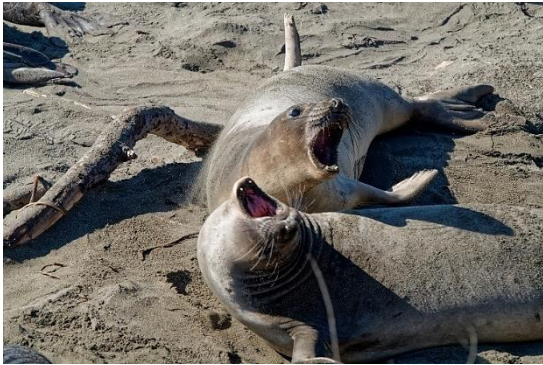
Above: Female elephant seals having a dispute. Right: Wine cellar at Hearst Castle.