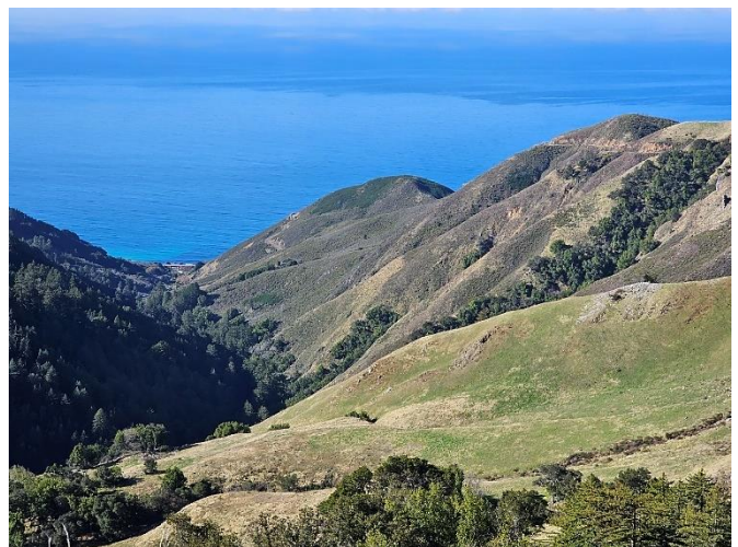
Right: A view from Nacimiento Fergusson Road.

We had beautiful weather for this trip. The hills are just starting to green up, but after this series of rainstorms, the area will be even prettier. It's a good time to take a ride on Nacimiento-Fergusson!