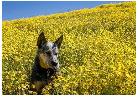
Left: Somis, Harvey's dog, in a field of Goldfields, 2019.