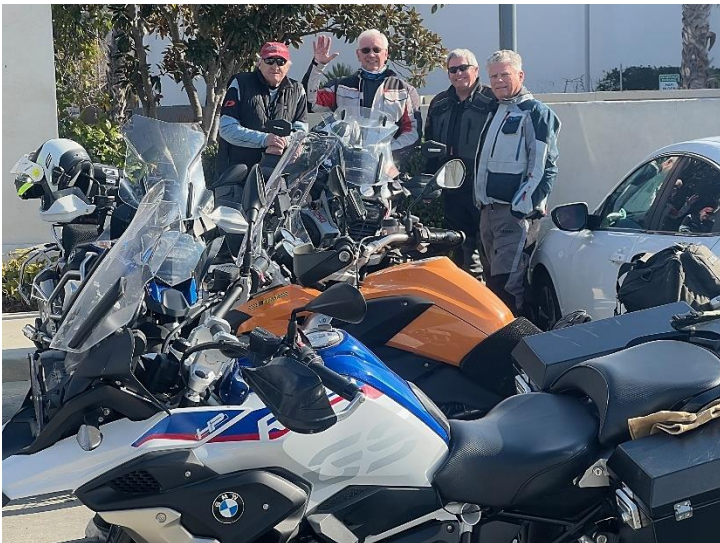
Right: Along Jalama Road.