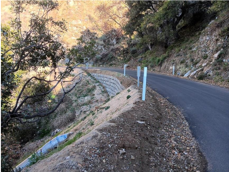
Left: One section of repairs on Nacimiento Fergusson Road. The road had many repaired sections.