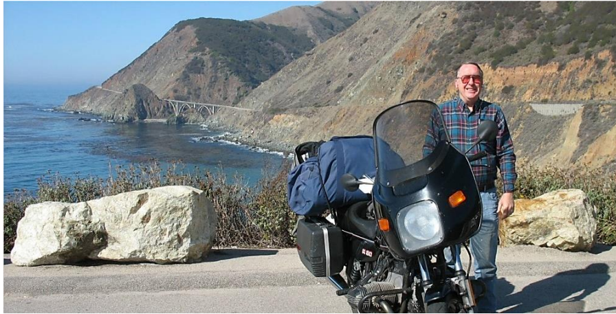
Harvey on Highway 1.