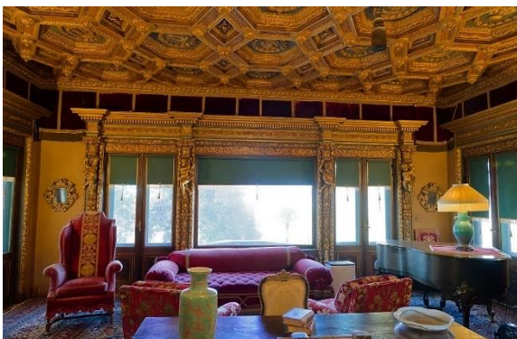
Above: One of the guest cottages at Hearst Castle.